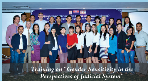
Training on “Gender Sensitivity in the Perspectives of Judicial System”