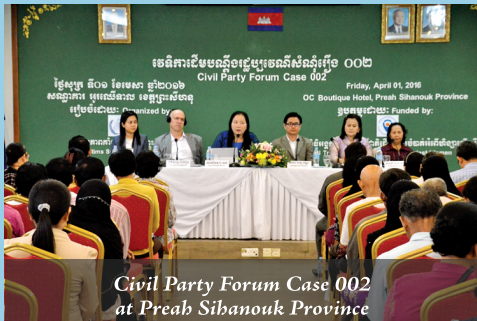
Civil Party Forum Case 002 at Preah Sihanouk Province

For female survivors, in particular GBV victims, criminal justice is essential to deal with the past. For the Cambodian society and the international community, criminal justice is equivalent to the end of impunity which has prevailed in cases of GBV over centuries. The VSS and TPO are running a series of activities to support female survivors and GBV victims in their quest for justice at the ECCC including: