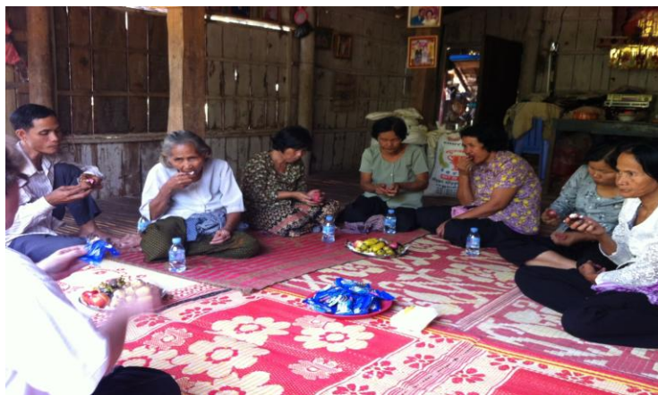
Group discussion, February 2013.

The evaluator conducted two group discussions and seven individual interviews with CDP clients. The project staff was responsible for contacting and organizing interviews with their clients. The interviews were conducted in English with translation in Khmer. There were two Khmer female interpreters. The first interpreter did the translation for the group discussions and four individual interviews. The second interpreter assisted in the three remaining interviews. The choice of female interpreters was deliberate so female interviewees would be more at ease during the interviews. The evaluator met and briefed the interpreters on the project prior to their first encounter with the clients.