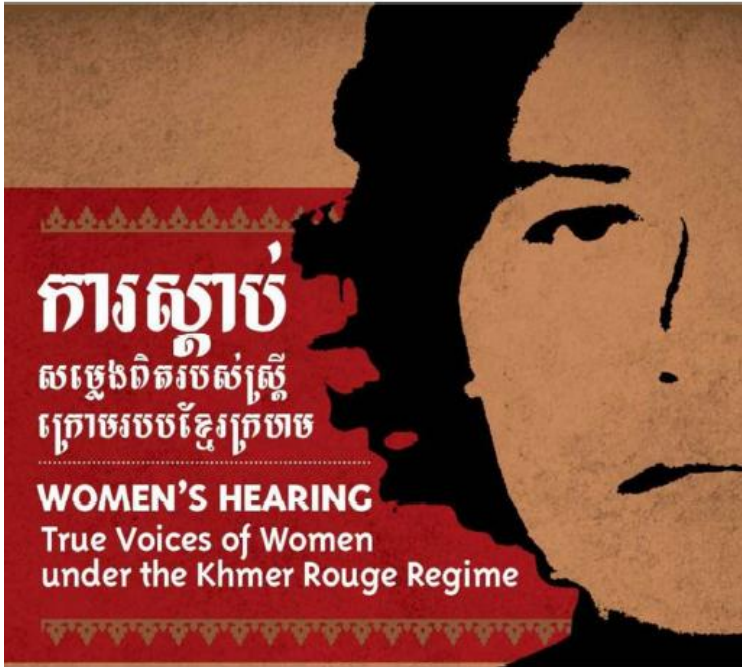
Flyer, Women's Hearing 2011, CDP GBV Project

Finally, the project has triggered interest among NGOs, especially those involved in ECCC-related activities. Some organizations have put information about GBV during the KR on their website or disseminated information to their constituencies. The project has also contributed to knowledge of GBV during the KR by documenting and publishing stories of victims of GBV during the KR.